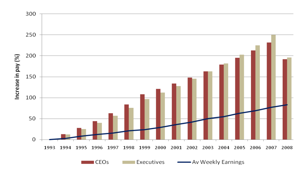
Figure 1: Comparison of percentage increase in pay

Figure 1 compares the percentage increases in CEO and senior-executive earnings and average weekly earnings.