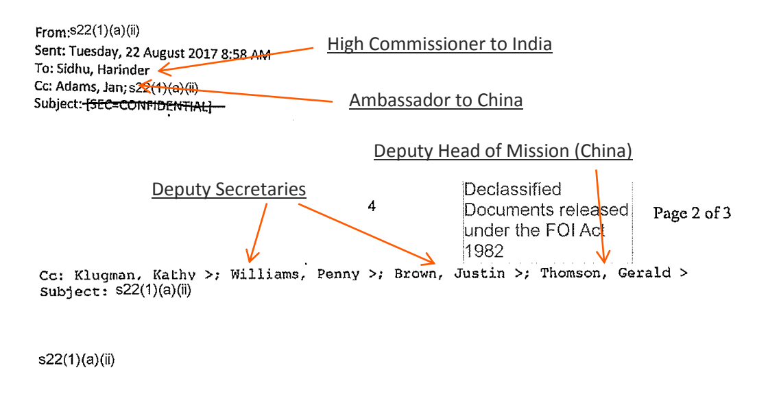
Figure 3 – DFAT FOI docs: senior diplomats discussing Adani's request, redacted

The FOI documents also include briefings from Austrade about a meeting with Adani's Australian CEO. These briefings list "Consultation" with the Department of Prime Minister and Cabinet, the Department for resources, and multiple parts of DFAT.