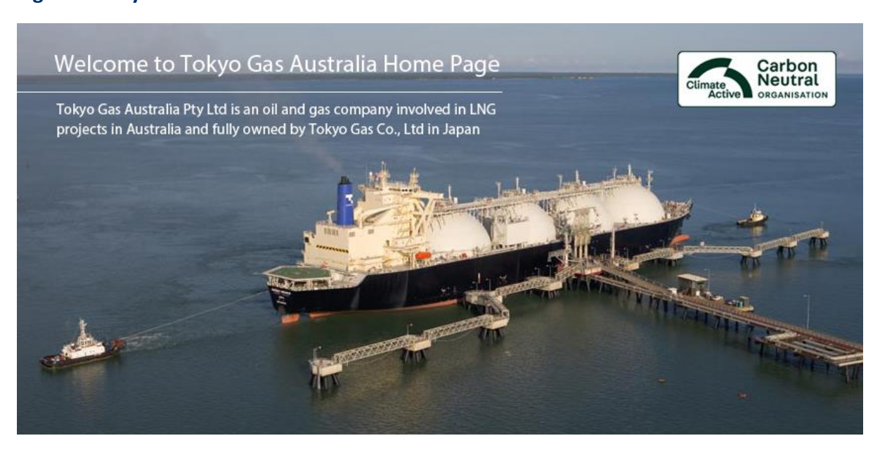
Figure 4 Tokyo Gas website